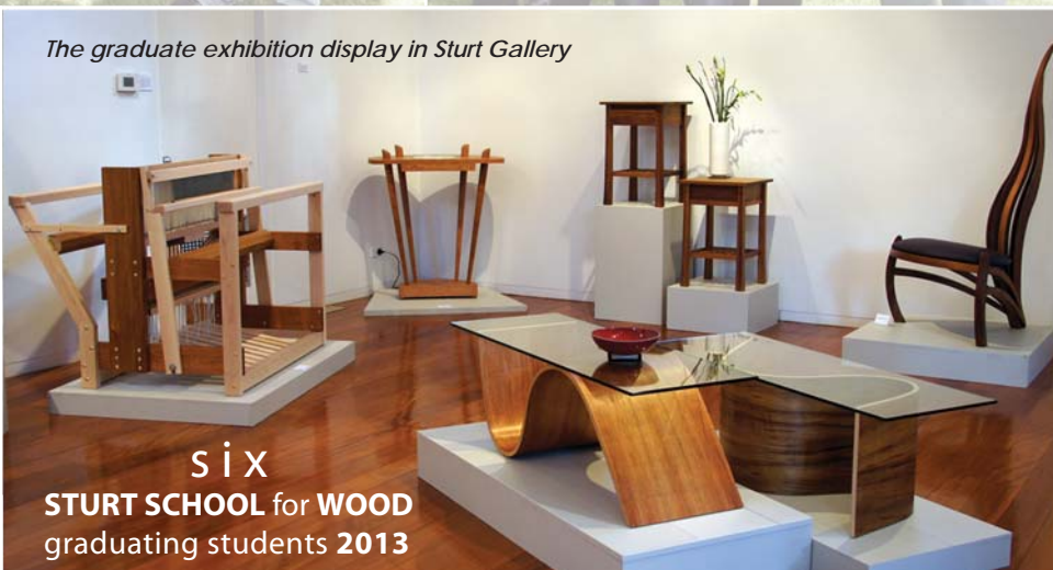
The graduate exhibition display in Sturt Gallery

SIX STURT SCHOOL for WOOD graduating students 2013